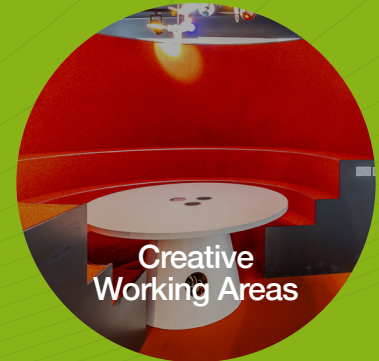
Creative Working Areas