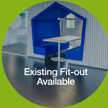
Existing Fit-out Available