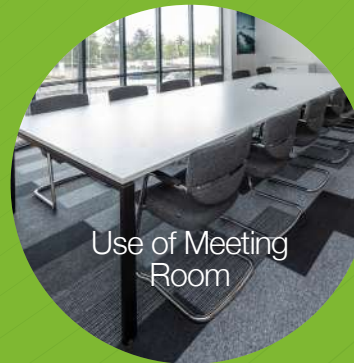
Use of Meeting Room